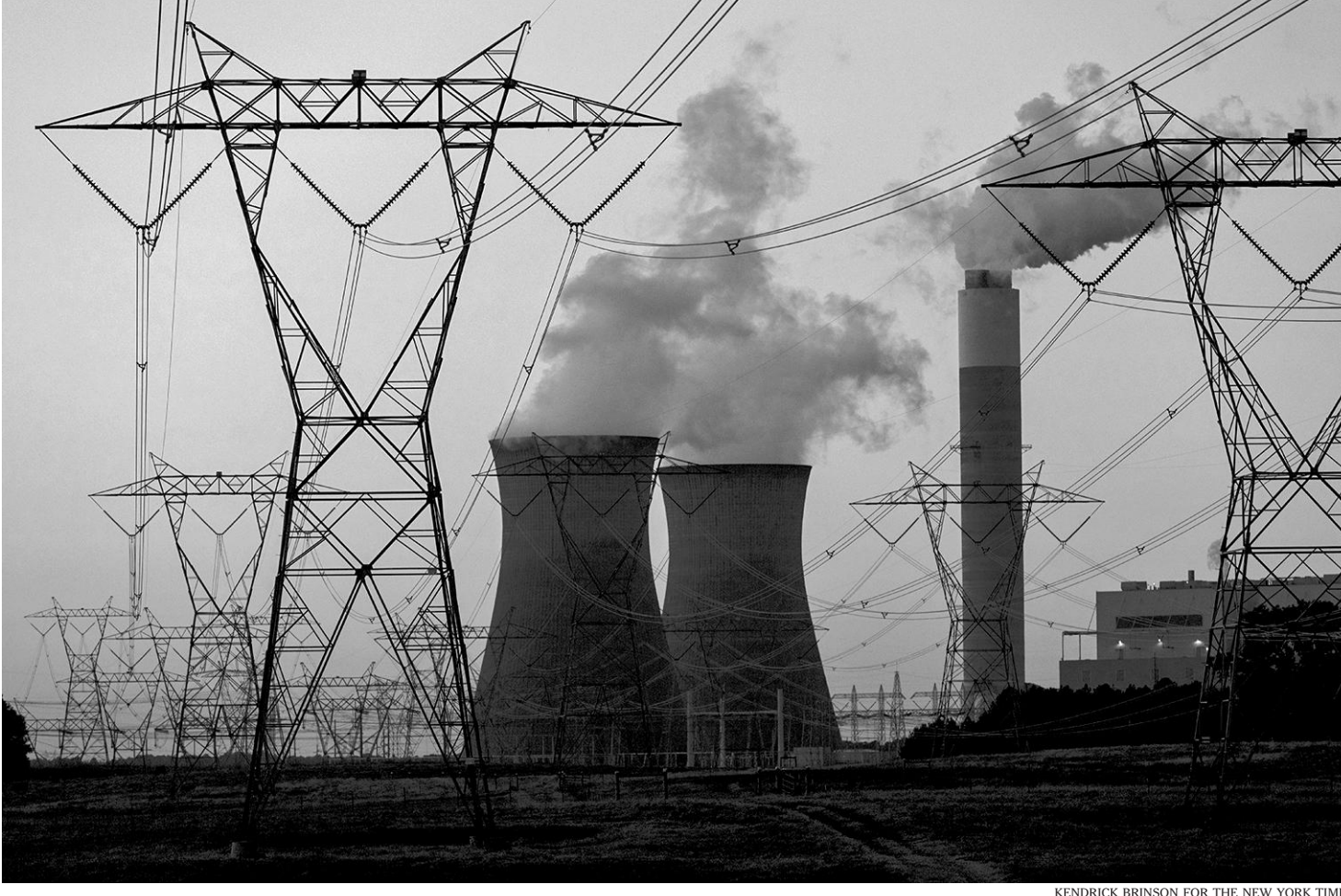
Google, Meta, Microsoft and Apple have made eliminating their carbon emissions a prominent corporate goal, one that runs up against regional utilities.

the growth of renewables, supporters sometimes point to Texas, whose power market, ERCOT, is one of the least regulated in the country. Last year, wind power accounted for nearly 23 percent of Texas' generation, up from 8 percent in 2011.